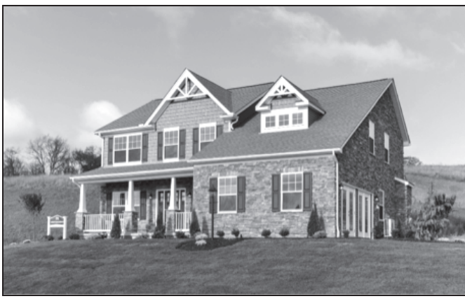
With help from the Pennsylvania Energy Efficient New Homes Program, S&A Homes was able to significantly improve the energy efficiency of their new construction homes.

The adage "waste not, want not" is second nature for many Pennsylvania homeowners.